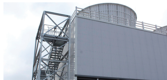
Fiber Reinforced Plastic (FRP) Works