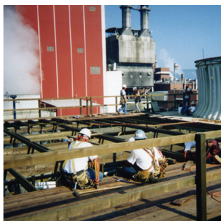
Preparation of Fan Deck Area

Following a comprehensive site assessment, our process for completing the structural work, from initial preparations to final inspections includes: