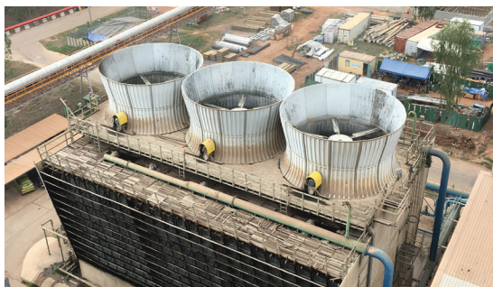
Surface Preparation and Coating of Removed Mechanical Parts